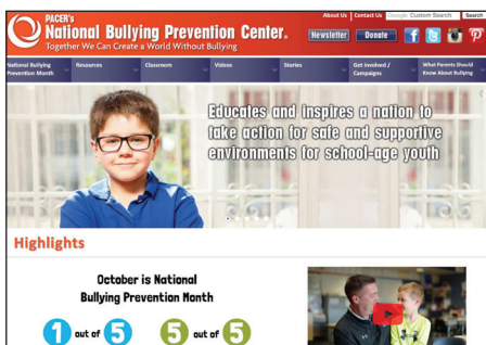
PACER.org/Bullying Parents, educators, and students!

Visit one of NBPC's websites for resources and inspiration