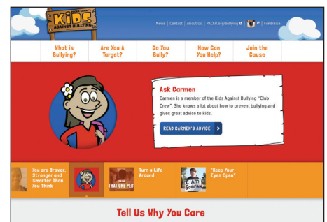
PACERKidsAgainstBullying.org Elementary school students!